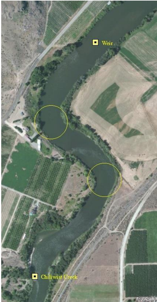
Figure 4. Map of the Okanogan River 1 km. below the weir. Observations from the bank will be directed in and around the two circled areas.