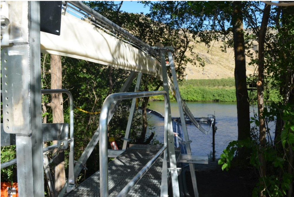
Figure 1. The configuration of the Whooshh™ tube system and the Okanogan weir trap. The tube is connected to the east, upstream side of the trap box and a stationary trailer on the east shore. Adult fish that are transported through the tube are directed into a 300 gallon tanker truck.