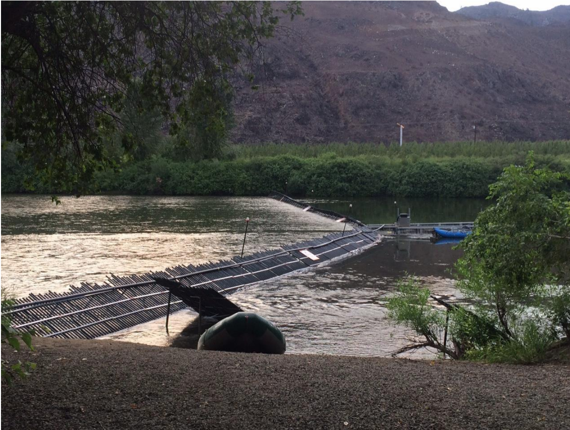
Figure 2. The deployed weir in 2014. The water deflecting panels are visible in the foreground.

A sediment plume during deployment has not been observed in past years. Nevertheless, turbidity shall not exceed 5 NTU's above background levels at 200 feet downstream of the project location. If the differential exceeds the allowable range, the particular construction activity that is responsible for introducing turbidity will be terminated until mitigating measures can be developed and implemented. A daily log of turbidity measurements will be updated and maintained on site (Datasheet #9)